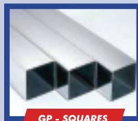
GP - SQUARES