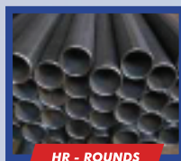
HR - ROUNDS