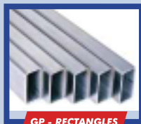
GP - RECTANGLES