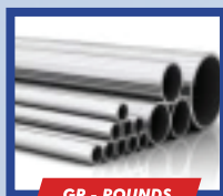
GP - ROUNDS