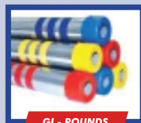
GI - ROUNDS