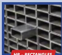
HR - RECTANGLES