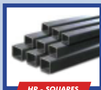
HR - SQUARES